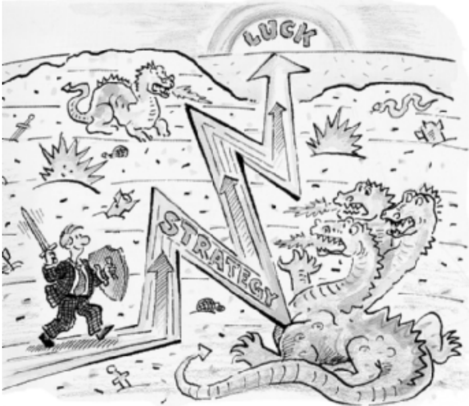
Good strategists also need good luck.

Entrepreneurs and managers who possess a high level of strategic management competence may make individual mistakes, but they do not allow themselves to be deterred from the vision, corporate philosophy, or continued development of their guiding idea. They comprehend the big picture intuitively, remaining above mundane matters and deliberately avoiding identification with them. They experience relationships both inside and outside the company, as well as strategy formulation and implementation, within an overall context. They also are affected more con-