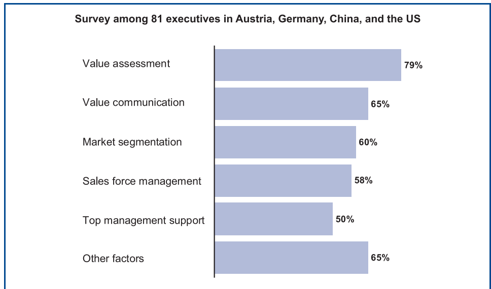
Figure 2 Obstacles to the implementation of value-based pricing strategies

reference value – plus the value of whatever differentiates the offering from the alternative – differentiation value.”